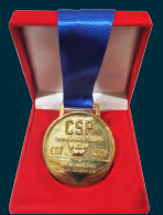
Certified Speaking Professional, VSA International