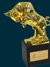
Golden Bull Award 2024